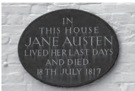
Plaque on 8 College Street, Winchester, England.